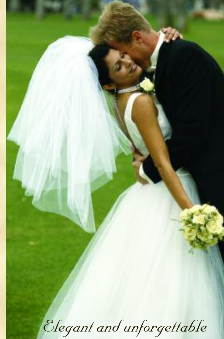
Elegant and unforgettable